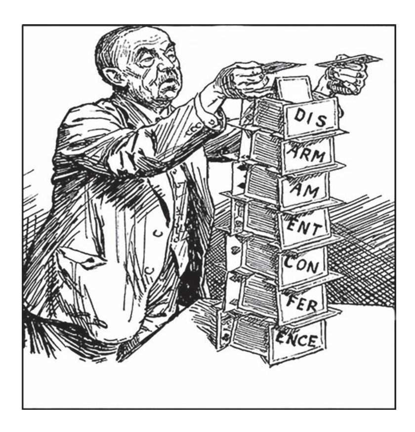
A cartoon showing the Prime Minister of France, published on the front cover of a British magazine, July 1934.

Answer both parts of the question with reference to the sources.